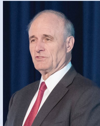
Keith Nosbusch Rockwell Automation